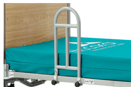
Assist bar to assist with bed mobility