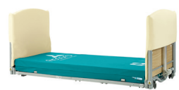
Head and foot board bumpers