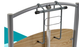
Mattress pump bracket

H&R Healthcare is passionate about service, striving to provide high quality products and superior customer care. Privately owned and operated for over 25 years, we have established ourselves as the premier provider of support surfaces, negative pressure wound therapy, and specialty medical equipment. From acute to long-term to home care settings, customers rely on H&R to provide cutting-edge healthcare products combined with clinical support, same-day delivery, and billing services.