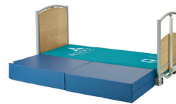
Safety mat provides same height as a FloorBed® with 6 inch foam mattress