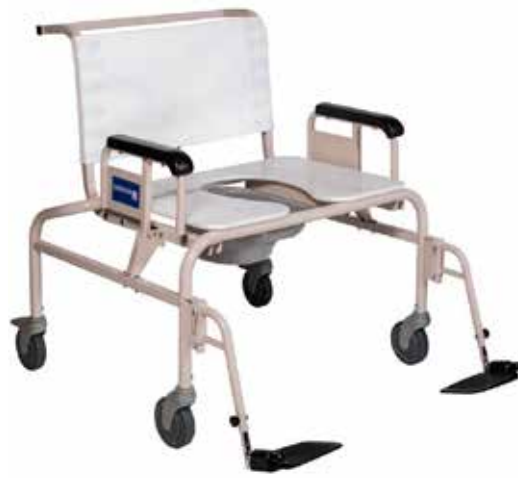
5226 / 5228 Bariatric Shower Commode Chair