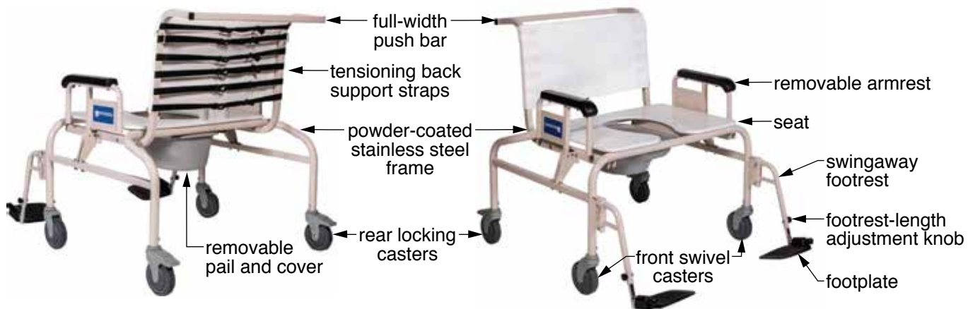
5226 / 5228 Bariatric Shower Commode Chair